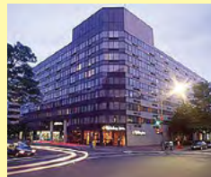
HOLIDAY INN CAPITOL

Optional Roundtrip Airport Transfers, pp: Reagan National - $30 Dulles - $54 BWI - $54